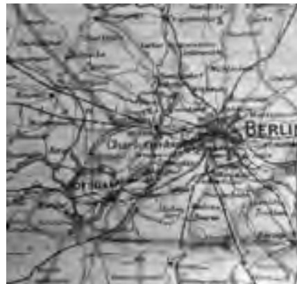
On one side, the map shows France, Germany, and Switzerland; the other shows Belgium and Germany. Details include elevations, roads and railways, towns, and bodies of water.