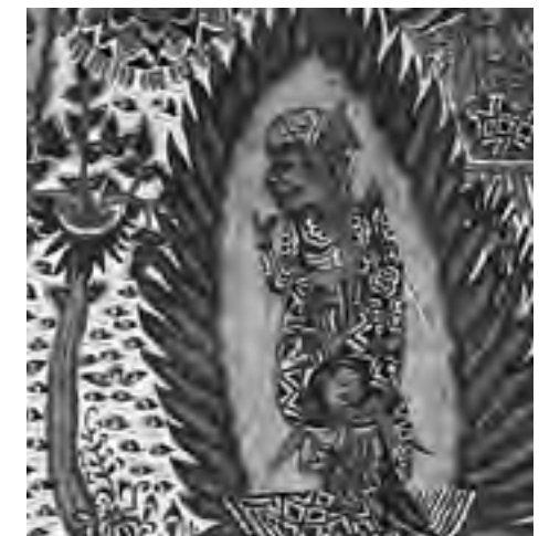
A detail of one of several cloth paintings from Bali that will be on display in the new exhibit.

Gallery exhibit, entitled Rain Forest Visions: Images of Cosmos and Nature , which will discuss the relationship between the natural environment and the spirit worlds of indigenous South American cultures.