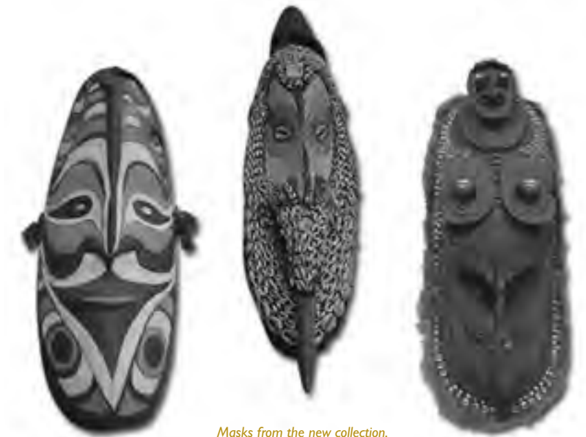
Masks from the new collection.

his travels in 1984 to 1990, they were given to the Logan Museum of Beloit College in 1995. Overwhelmed by space and care demands of such a large number of items, Logan staff and curators carefully culled the collection and offered selected artifacts to other museums. A number of these artifacts